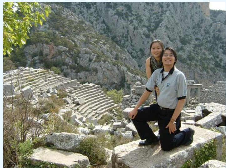
First University in the WORLD (Amphitheatre), Temessos