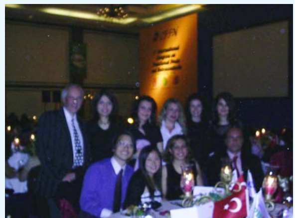
Last night's “GALA DINNER”