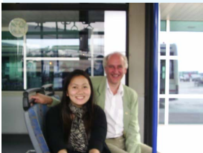
First touch down in ISTANBUL, Turkey

Also, prepare your “no-notes talks.” By such talks I don’t mean your formal technical presentation. What I mean are the informal talks you give