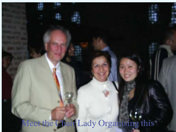
Meet the Chair Lady Organising this

Follow up with a note and promised abstracts or publications to the contacts you made. Ask them to send promised material. Follow up with presenters you missed and ask for a copy of their handouts. Follow up by summarizing what you learned, particularly the informal insights, in an e-mail message, and send it to your colleagues as well as those people you met at the conference. This is a very appreciated service and will get you noticed by other professionals.